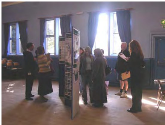
Miner's Welfare Hall – 23 rd September

Public consultation on the Business Plan forms part of the statutory planning process. Information was displayed at the first event, held alongside the Dancing through the Dean event on 8th July in The Triangle. Over the last few months, this has been followed by staffed exhibitions, exhibition displays at the library and Belle Vue Centre, attendance at specific events and stakeholder meetings. Examples include: a presentation to the Forest's Local Strategic Partnership Conference on 20 th September; Miner's Welfare Hall exhibition on 23 rd Sep; Forest Showcase event on 8 th October; Forest Business Futures workshop session for local businesses on 16 th October; a presentation to the Forest's Landlord's Forum at the Belfry Hotel, Littledean on 17 th October; and a discussion with Churches Together at Cinderford Methodist Church on 14 th November.