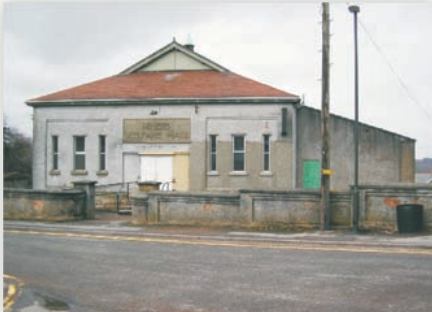
Miners' Welfare Hall - front elevation

In March, a revised business plan will be presented to English Partnerships (EP), in a bid to secure Coalfield Programme funding to transform this building.